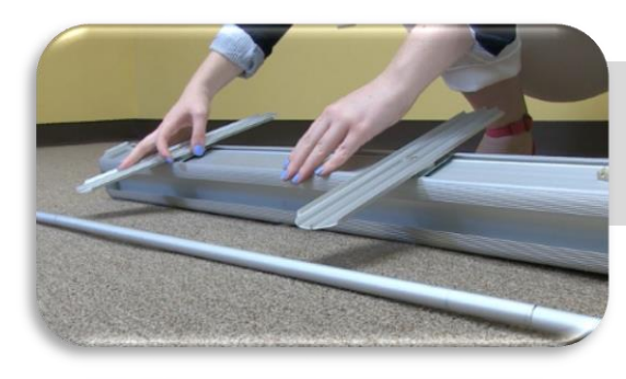
Flip the base of the banner over and rotate the feet to sit perpendicular to the base.