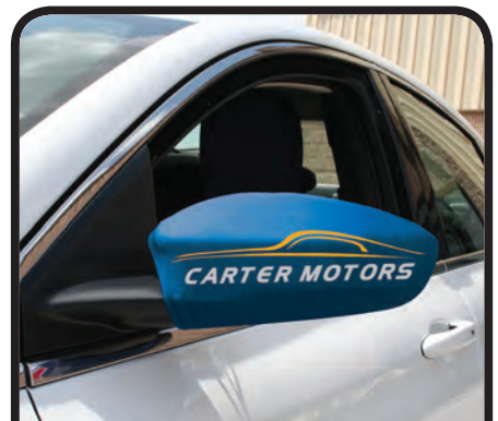
Example of Small Size Car Mirror Cover