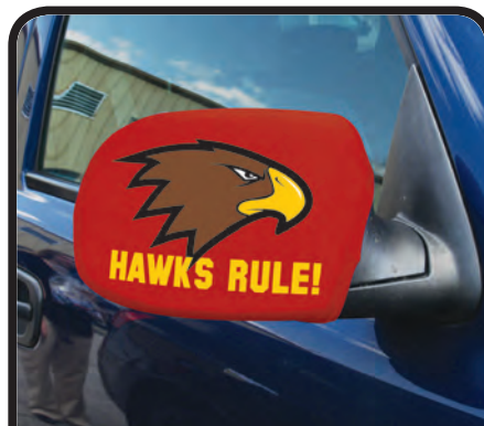
Example of Large Size Car Mirror Cover

Adjust the Car Mirror Cover accordingly to remove any wrinkles and ensure a proper fit.